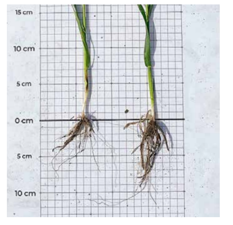
A comparison of wheat seedlings a few weeks after sowing during a seed treatment trial. Left: control. Right: Winter wheat seeds were treated with RhizoVital®C5