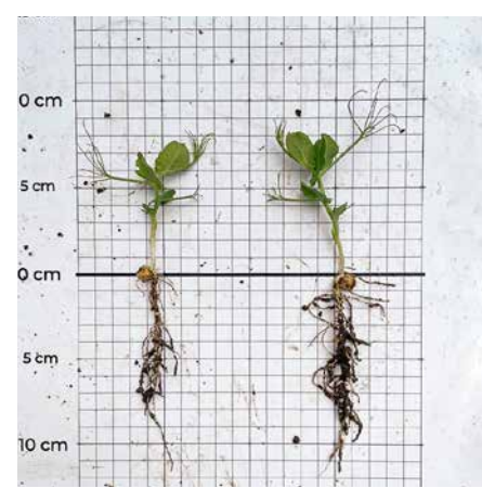
A comparison of pea seedlings a few weeks after sowing during a seed treatment trial. Left: control. Right: Pea seeds were treated with RhizoVital<sup>®</sup> C5-credit: Andermatt Poland.

Andermatt Polska and HR Smolice, a Polish seed breeding company and exporter to the EU, partnered to offer growers a solution for cold, wet spring conditions. The collaboration led to the launch of RhizoVital<sup>®</sup> C5-treated seeds under the Polish brand Rhizoseeds.